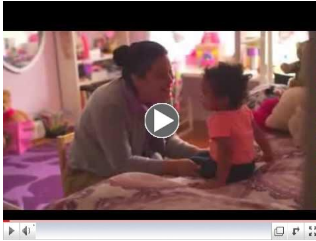
First 5 California "Anthem" TV Commercial 2014